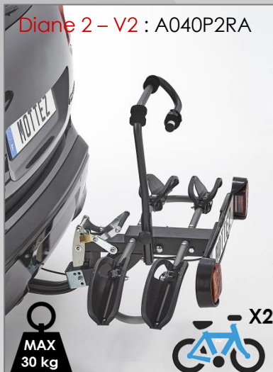
Diane 2 – V2 : A040P2RA