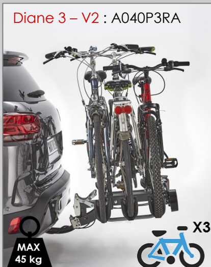
Diane 3 – V2 : A040P3RA