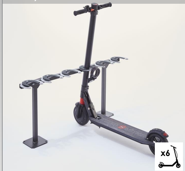
Side by side