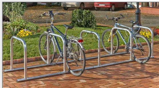
1 x B882C3 + 2 x B882SSUI For 10 bikes