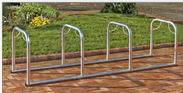
1 x B882C3 + 1 x B882SSUI For 8 bikes