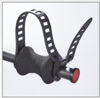
(specially designed for big size frames Ø130mm max and/or 408mm circumference)