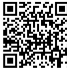
VIDEO DEMONSTRATION M061Q